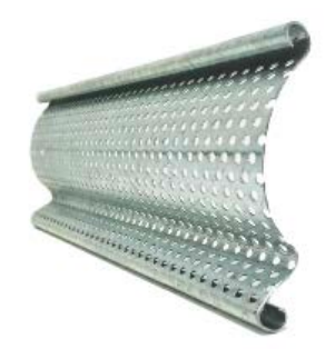
Perforated Steel Single Steal Lath with perforated holes to transfer light. Exceptional strength, suitable for medium to large premises.