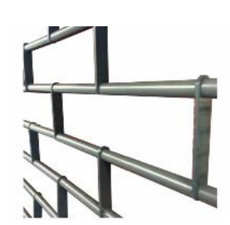
Block/Chain Lath stacked in a Brick formation providing visuals and airflow into the premices as well as security.