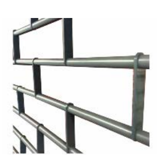
Block/Chain Lath stacked in a Brick formation providing visuals and airflow into the premices as well as security.