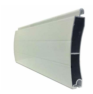
Aluminium Standard option for medium to large commercial properties. Exceptional strength at a low budget.