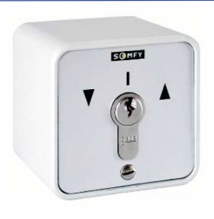
Key Switch Key based security, easyto-use operation, Hold down to run operation.