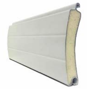
Insulated Steel A double skinned steel profile with a polyutherene insulating core, soundproofing and insulation.