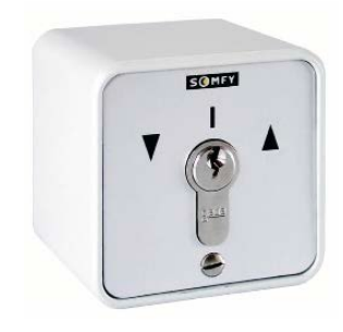
Key Switch Key based security, easyto-use operation, Hold down to run operation.