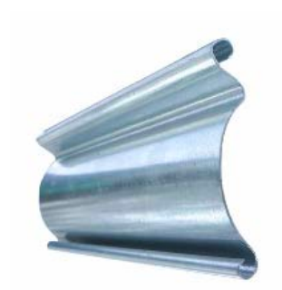
Galvanised Steel Standard option for medium to large commercial properties. Exceptional strength at a low budget.

Below is a list of our popular curtain slates for commertial properties: