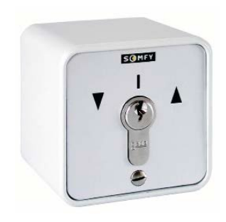
Key Switch Key based security, easyto-use operation, Hold down to run operation.